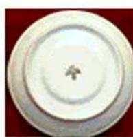
Castle Formulation with APG