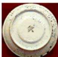
Regular Market Product