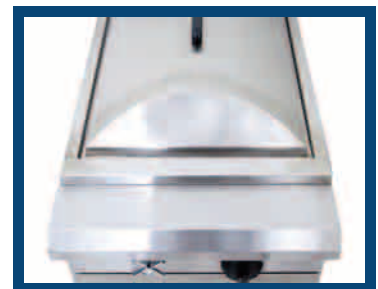
Stainless Steel Finish